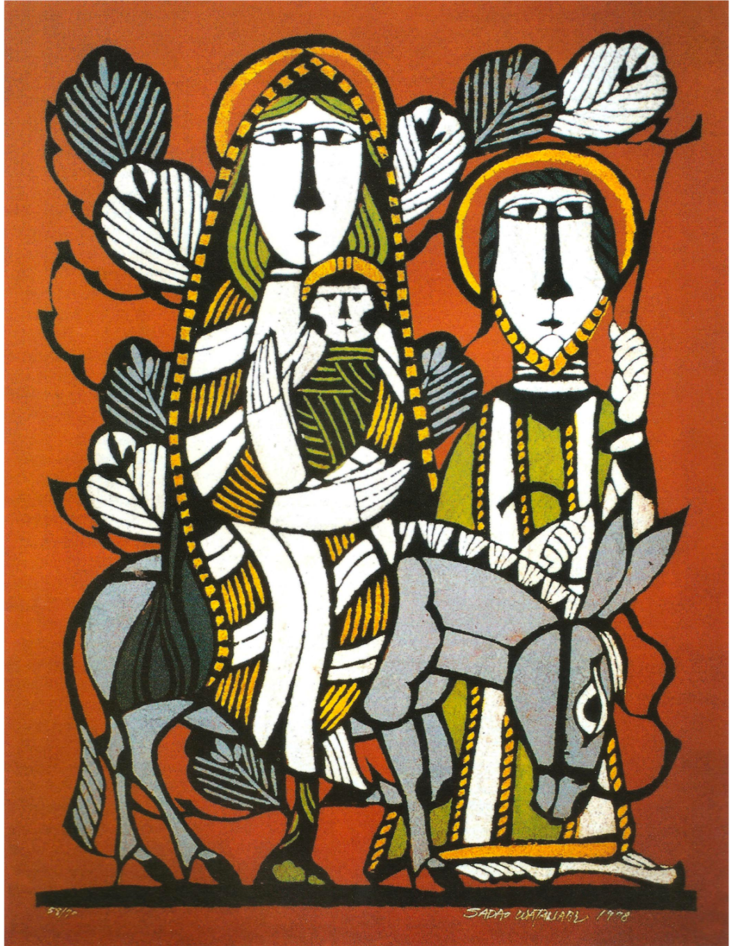
"Flight Into Egypt" (1978) - Sadao Watanabe

DEC. 17TH, 2023 5:00 PM ST. JOHN'S CATHEDRAL